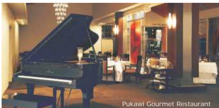
Pukawi Gourmet Restaurant