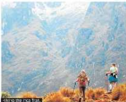
Hiking the Inca Trail