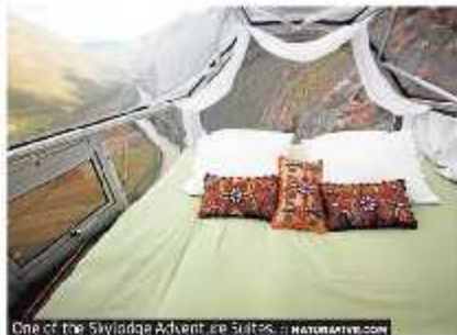
One of the Skydodge Adventure Salas pods. www.nauarivivo.com