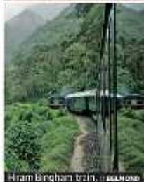
Hiram Bingham train