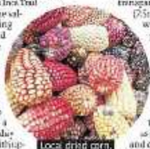
Local dried corn

A truly unique experience, these transparent sleeping pods (2.5m x 2.5m), complete with tea, are suspended 400 metres above the valley, secured to the 'hoes of the mountain'. The views are clearly panoramic, but access is not for the faint-hearted, as you have to climb up and down using metal steps, the 'Via Ferrata'. Available to rent through Nana's Cave, who also offers zip-line adventure activities. Info@nauarivivo.com