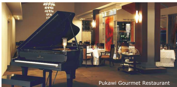
Pukawi Gourmet Restaurant